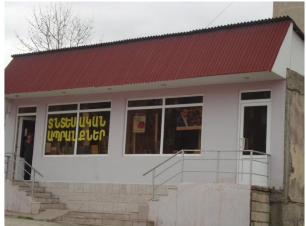
p. 2. on public trade venues