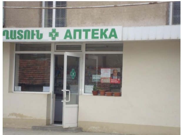
p. 10. on public trade venues