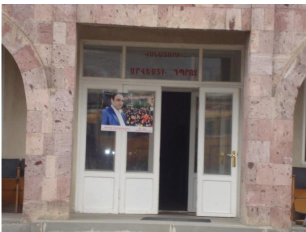
p. 5. on state educational institution