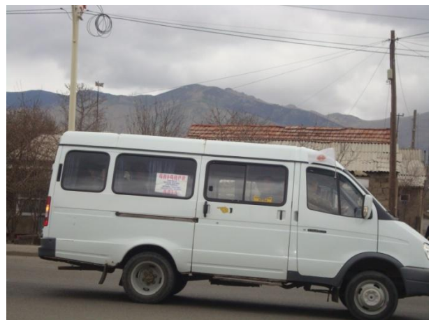
p. 4. on public transportation