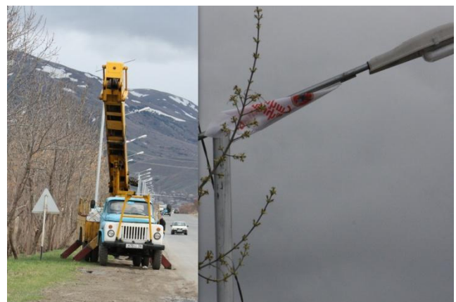
p. 12. posting an RPA flag on the electricity poles along Vanadzor-Spitak highway