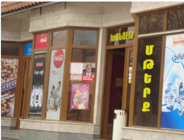
p. 7. on public trade venues