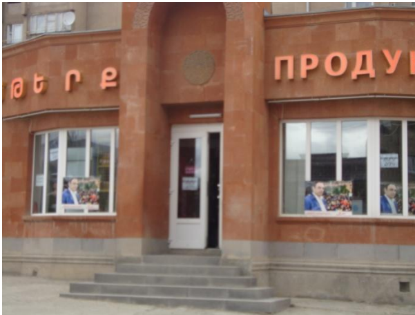
p.1. on public trade venues