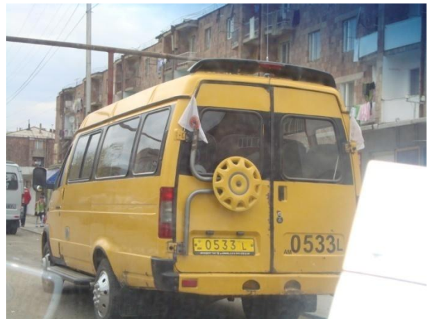
p. 8. on public transportation