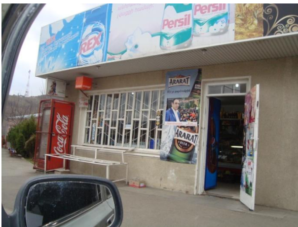
p. 3. on public trade venues