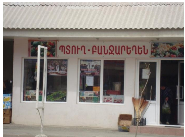
p. 6. on public trade venues