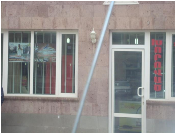
p. 9. on public food venues